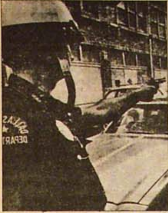
Policeman take aim on unarmed Black people.