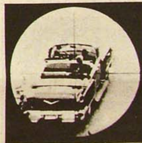
Photograph (through rifle scope) of re-enactment of Kennedy assassination by the Warren Commission. Last week, a potential witness for the House Assassinations panel was shot to death.

These individuals would face the choice of standing trial or entering a guilty plea and cooperation. CONTINUED ON PAGE 25