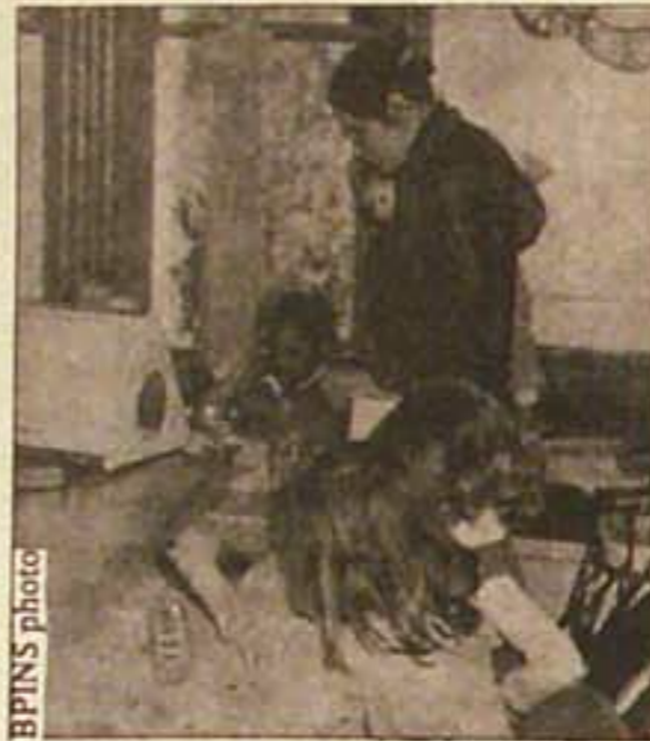
Oak Street Community Center. Anyone wishing more information about the April 20 benefit or about the programs of Oak Street Community Center may write to the Center at 1915 Oak Street, San Francisco, California 94117, or call (415) 387-1650. □

The Center wants to expand its programs to include Legal and Welfare Referral services and a Senior Citizens' program. But such expansion takes money, and the Center regularly sponsors numerous fundraising activities, including garage and bake sales.