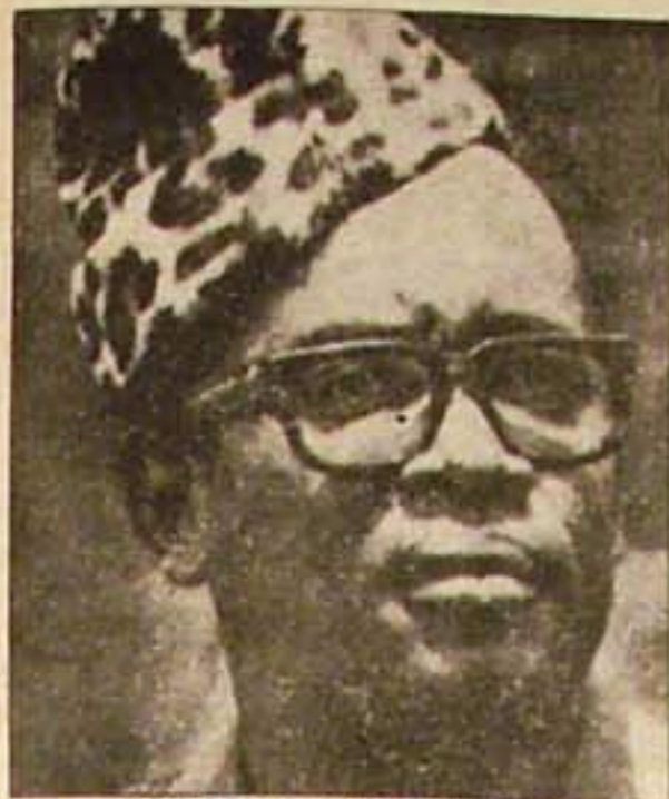
MOBUTU SESE SEKO