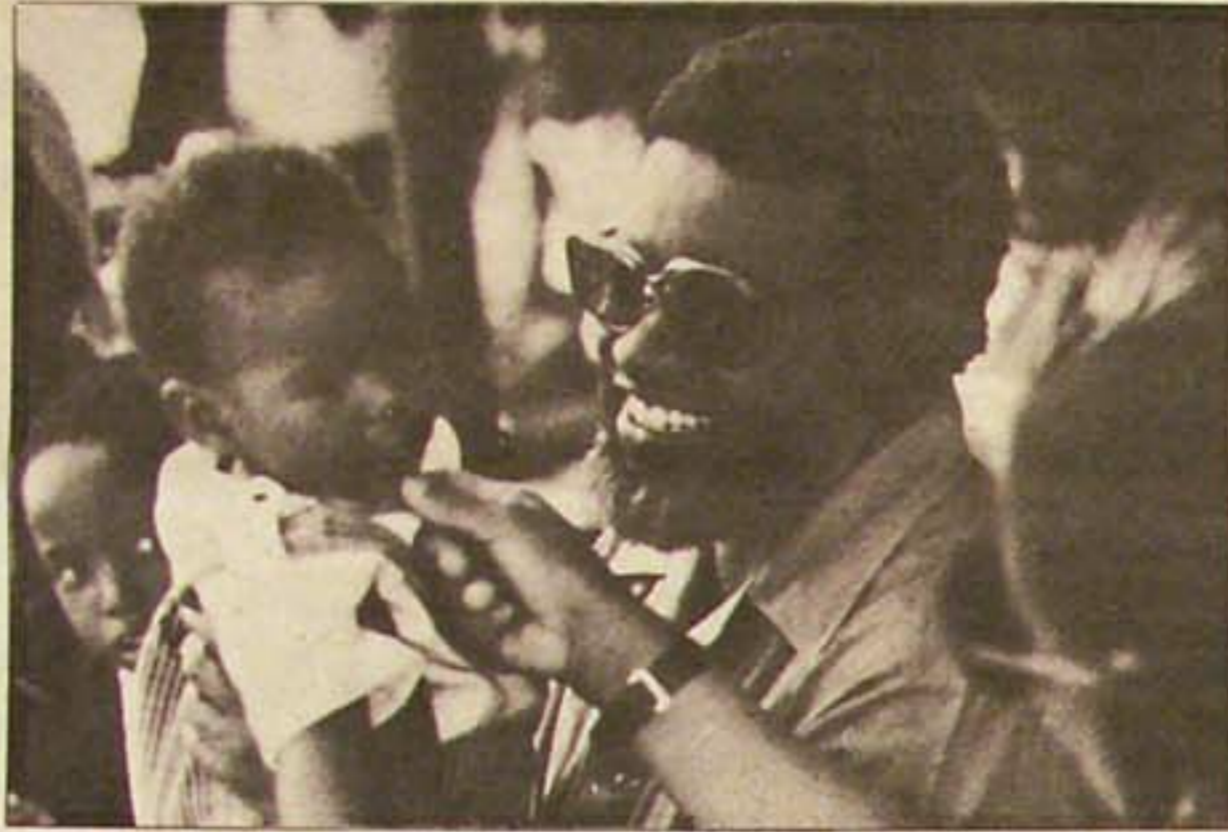
SWAPO President SAM NUJOMA.

Official court languages are English and Afrikaans. Interpreters must therefore be employed in trials involving one or other of Namibia's indigenous languages. In such cases, disputes frequently arise concerning the interpretation of particular concepts and