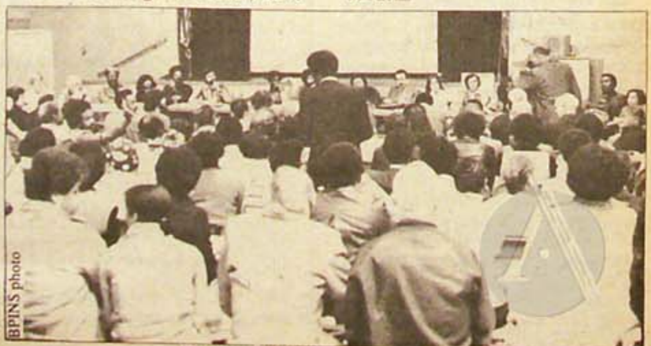
Recent OCCUR membership meeting.

According to a study by the University of Notre Dame, as many as a quarter-of-a-million men would be affected by a general amnesty program, if implemented. This would include 250,000 men with "bad paper" discharges and 3,000 deserters who are still fugitives. □