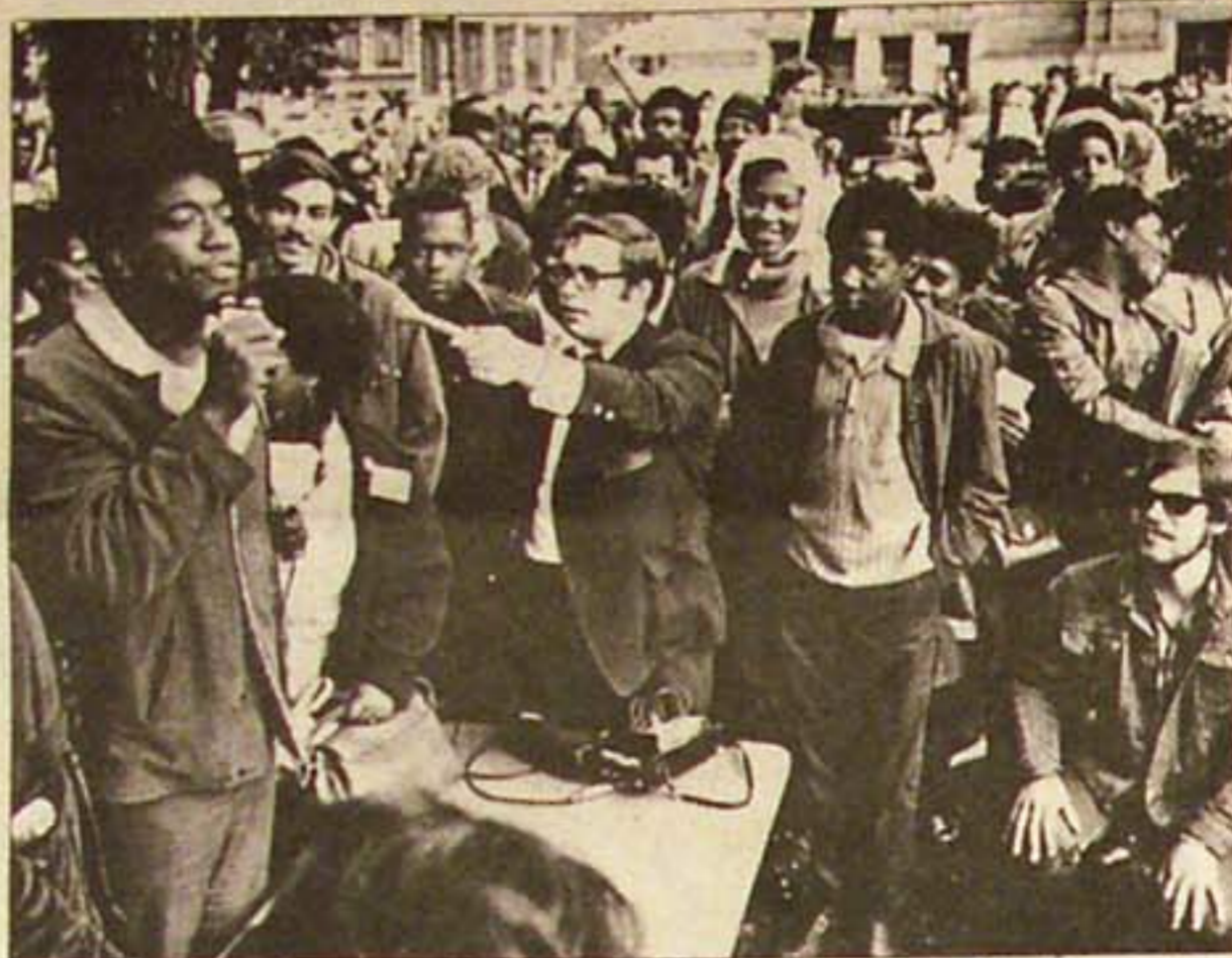
FRED HAMPTON addressing downtown Chicago rally before his assassination.

This is a key point in the case, the key aspect of the cover-up in which the judge joins the other side, fights you, makes arguments for the defense and holds you in contempt; and stops your