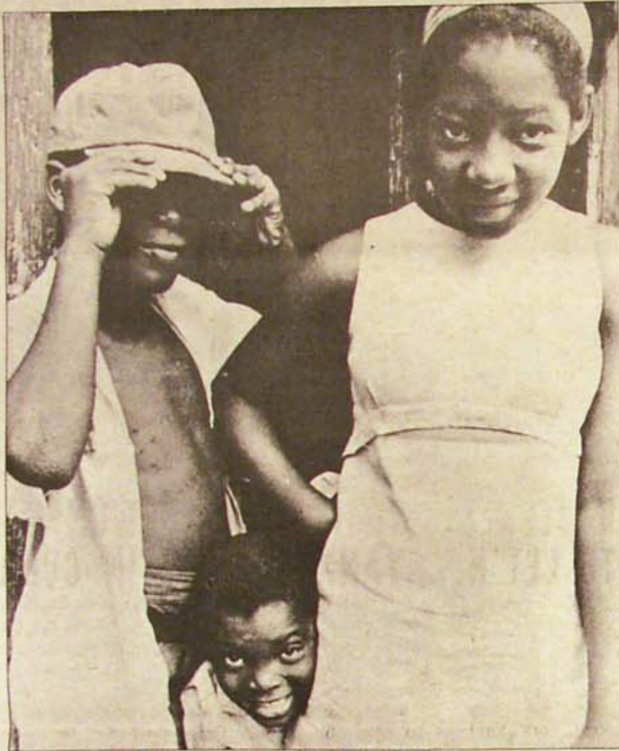
Happy children in revolutionary Cuba.

Helping to throw off his own oppressors obviously gave him a pride in himself nothing else could, and, as he talked, I saw in his eyes a quality my own father's eyes had sometimes lacked: the absolute assurance that he was a man whose words — because he had acted on his beliefs — would always be heard, with