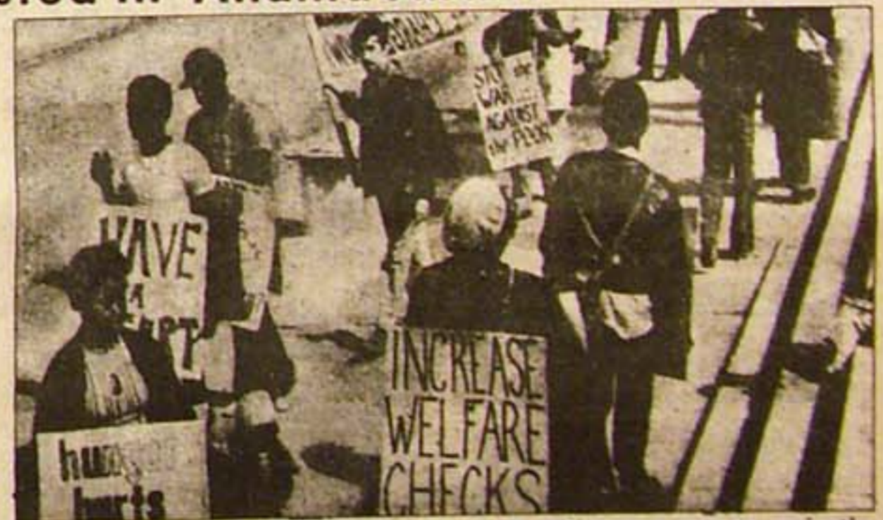
Atlanta, Georgia, welfare protest where 24 women were unjustly arrested.

quickly descended on the protestors, arresting 24, mostly women.