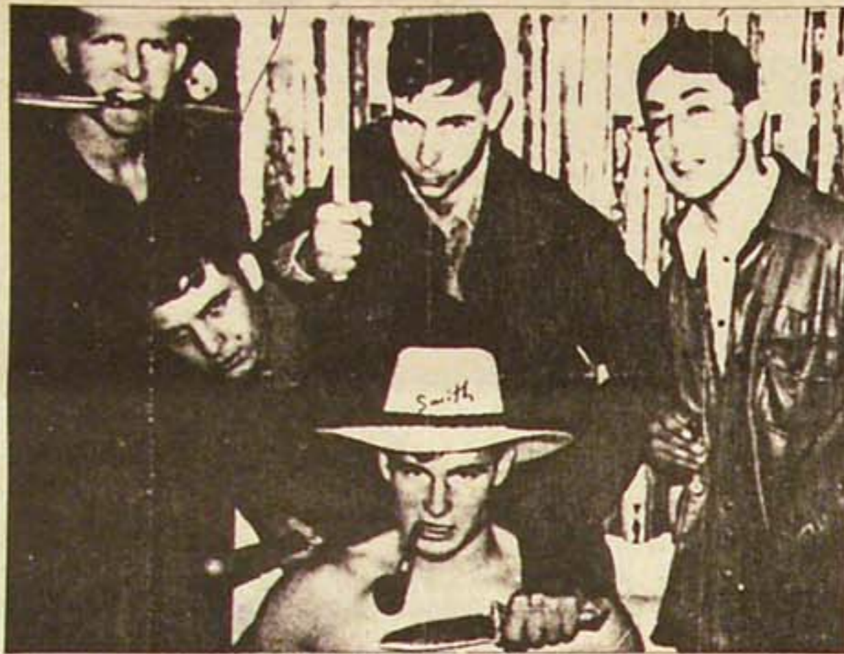
Camp Pendleton Klansmen.

The defense is arguing that Black Marines — faced with an increasingly desperate situation in which the Marine command had failed to counteract, or even acknowledge, the physical threat to Blacks — had mounted a show of strength in self-defense.