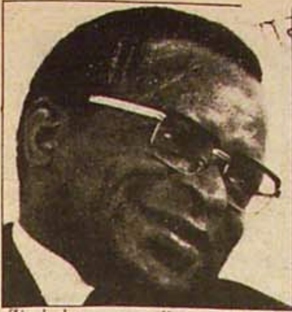
Zimbabwean sellout Bishop ABEL MUZOREWA.