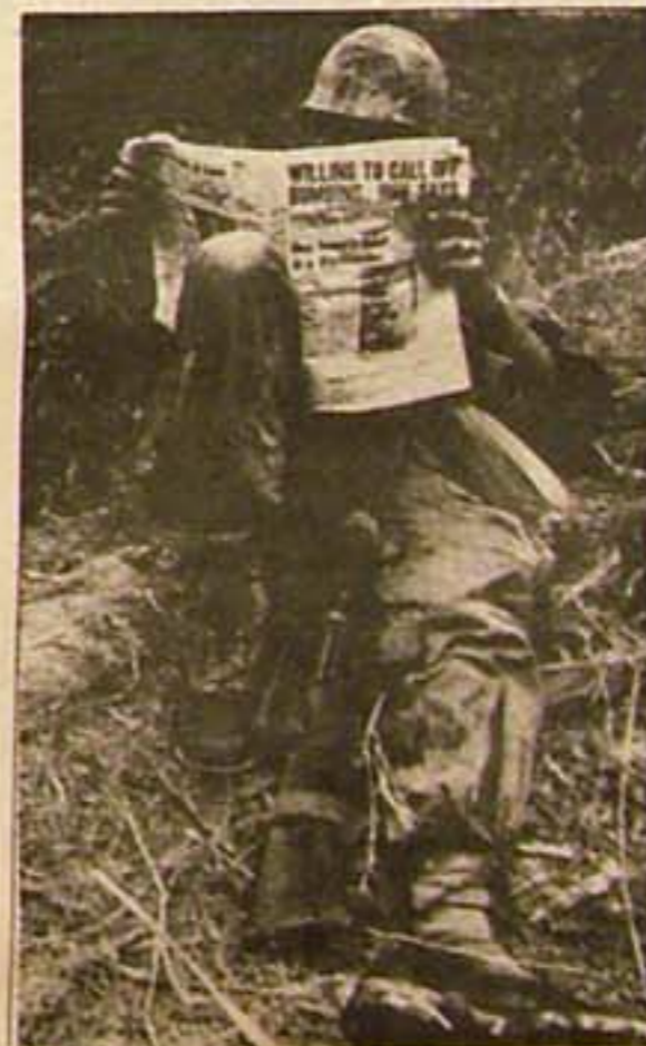
Black soldier in Vietnam reads news from back home.