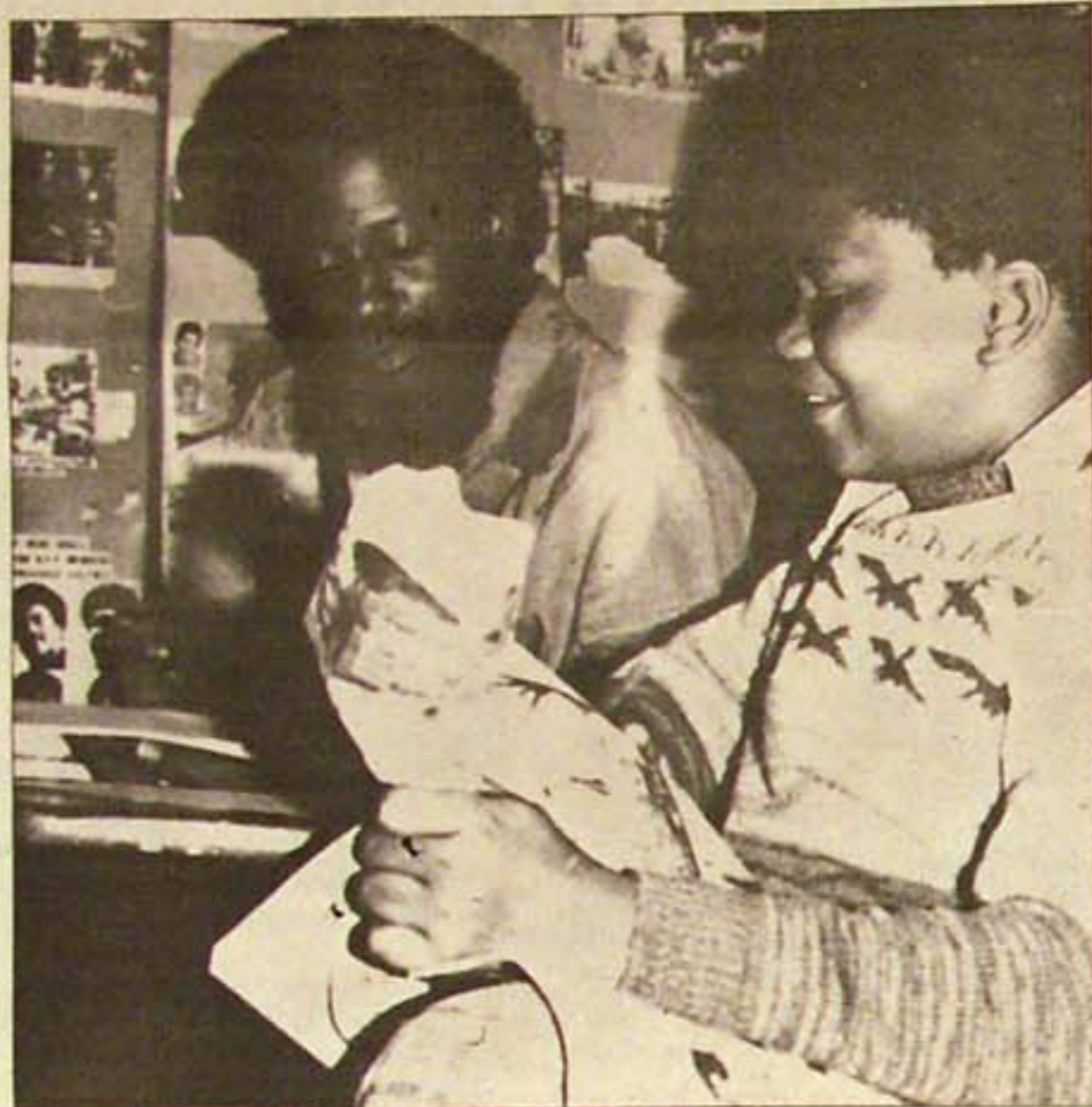
Southern California BPP Chapter "Tutorial Session."