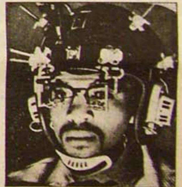
Professional "human research subject."

work to that of a prostitute. I mean, so what if I give a little bit of my body? I'm not hurt, I get paid. And maybe, as a fringe benefit, somebody else will even benefit." □