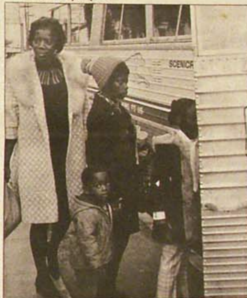
FREE BUSING TO PRISONS PROGRAM

Provides new, stylish and quality clothing free to the people.