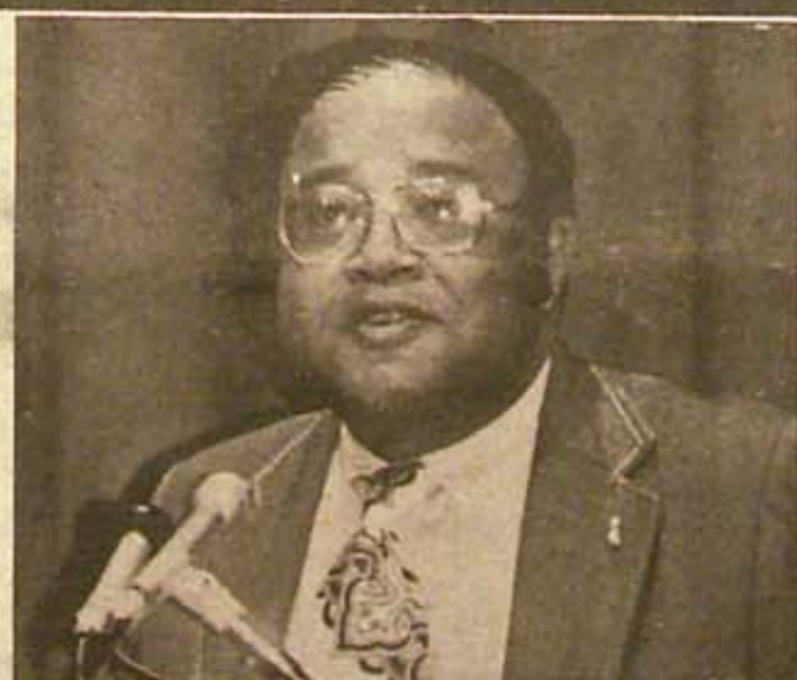
Congressional Black Caucus chairman PARREN MITCHELL (center, top photo), RON DELLUMS (left, top photo), JULIAN BOND (bottom, left) and CHARLES DIGGS are among the sponsors of the Committee for Justice for Huey P. Newton and the Black Panther Party.

(Oakland, Calif.) - The Committee for Justice for Huey P. Newton and the Black Panther Party has announced major new supporters in its ongoing campaign to halt the political repression focused against the BPP and to create a favorable climate for the expected return of the much-respected, exiled BPP leader.