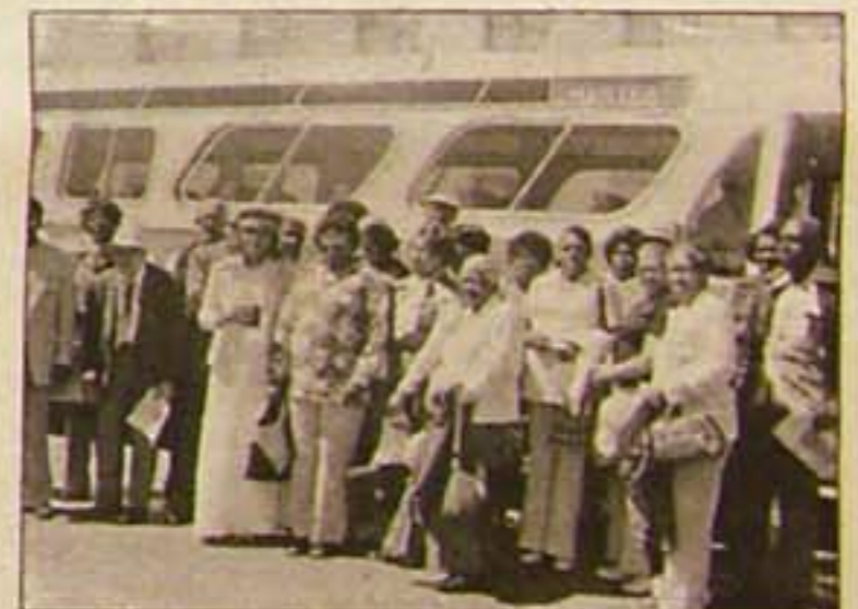
SENIORS AGAINST A FEARFUL ENVIRONMENT (S.A.F.E.) PROGRAM

Provides 24-hour child care facilities for infants and children between the ages of 2 months and three years. Youth are engaged in a scientific program to develop their physical and mental faculties at the earliest ages.