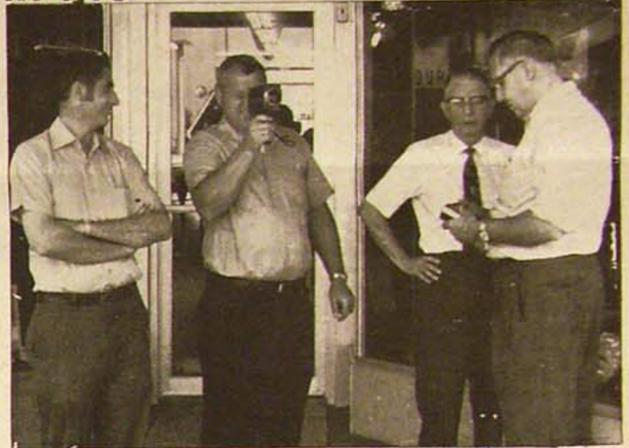
Police conducting film surveillance. The federal government announced last week that it may not prosecute FBI agents for illegal break-ins.

In other major developments in the Kennedy murder probe, a woman who worked in a Dallas nightclub before the President's assassination told Committee members in a secret briefing that Oswald's killer, Jack Ruby, intro-