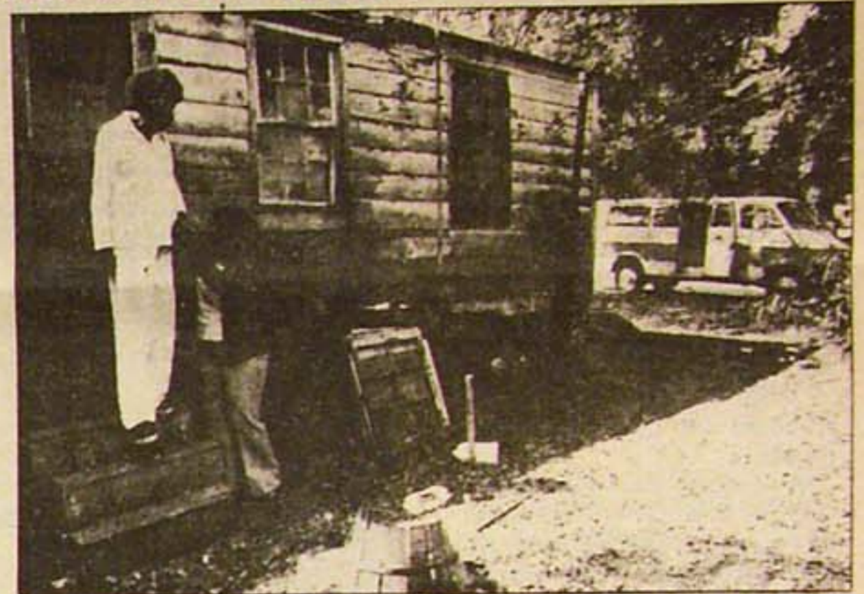
Beaufort County, South Carolina, woman being helped to van to be taken to clinic for medical treatment.

Not since 1961, when civil rights activists protested, has the Georgia state legislature been disrupted in such a militant demonstration. State troopers