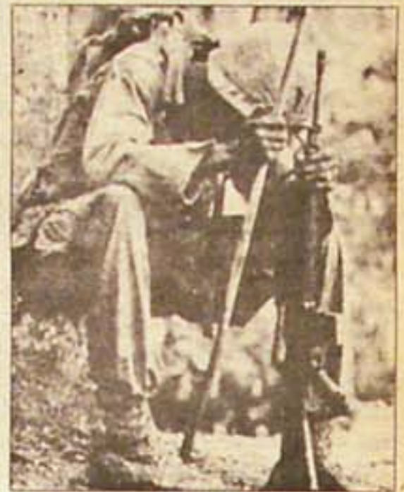
Despondent Black G.I. in Vietnam.