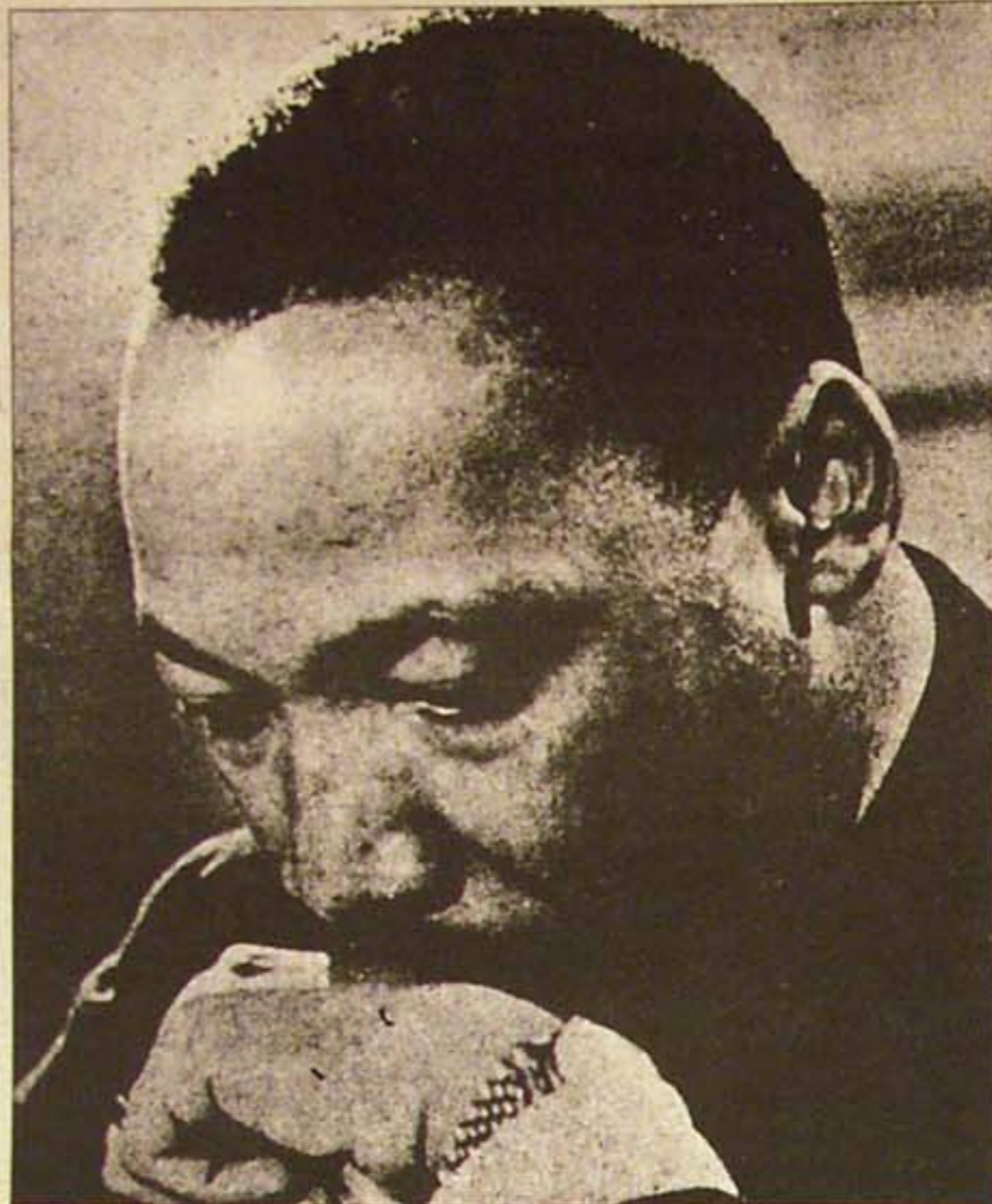
Dr. MARTIN LUTHER KING, Jr. Born: January 15, 1929 Assassinated: April 4, 1968

As for psychosurgery, the government's original intent in the early 1970s was to "study the causes of violence among 'ghetto rioters' and criminals." Guess who gets zapped? Niggers and the poor.