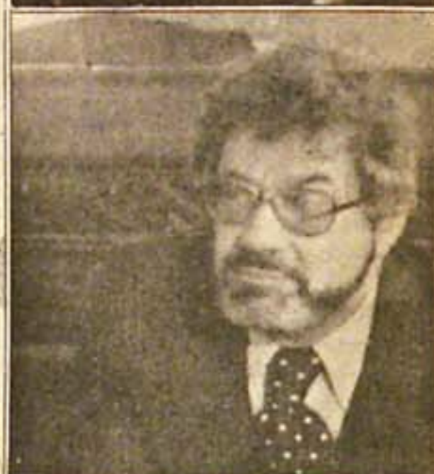
Comedian DICK GREGORY (top right) and author MARK LANE are among the many distinguished individuals who have come to the support of Black Panther Party founder and leader HUEY P. NEWTON .

serve impoverished Black and poor communities, Bond was one of the youngest persons in history elected to the Georgia Assembly. When racist assemblymen refused to grant Bond his seat, the youthful legislator fought a successful courtroom battle.