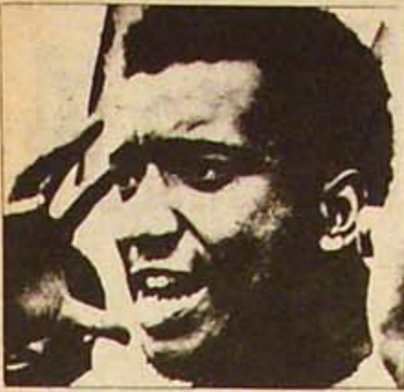
Fallen Comrade FRED HAMPTON.