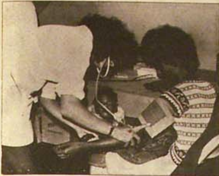
GEORGE JACKSON MEDICAL CLINIC

"All these programs satisfy the deep needs of the community but they are not solutions to our problems. That is why we call them survival programs, meaning survival pending revolution." —Huey P. Newton