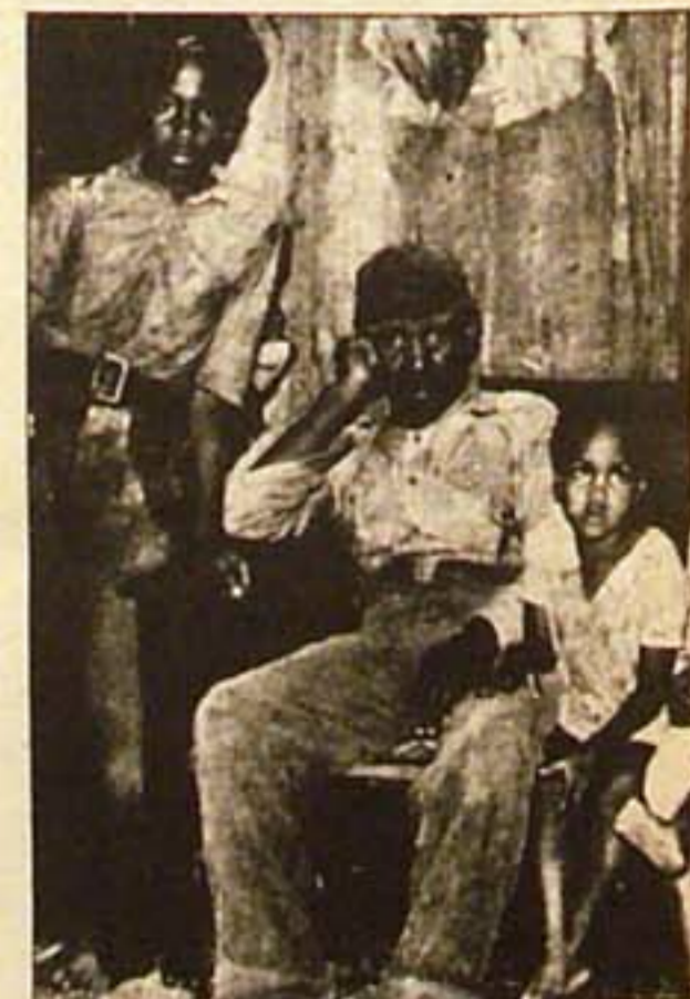
Poverty-stricken South Carolina family.