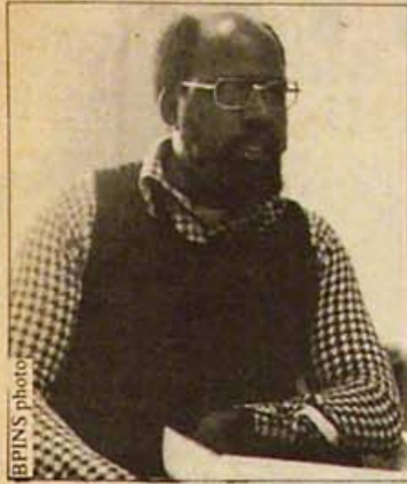
HARRY EDWARDS, popular U.C. sociology professor.