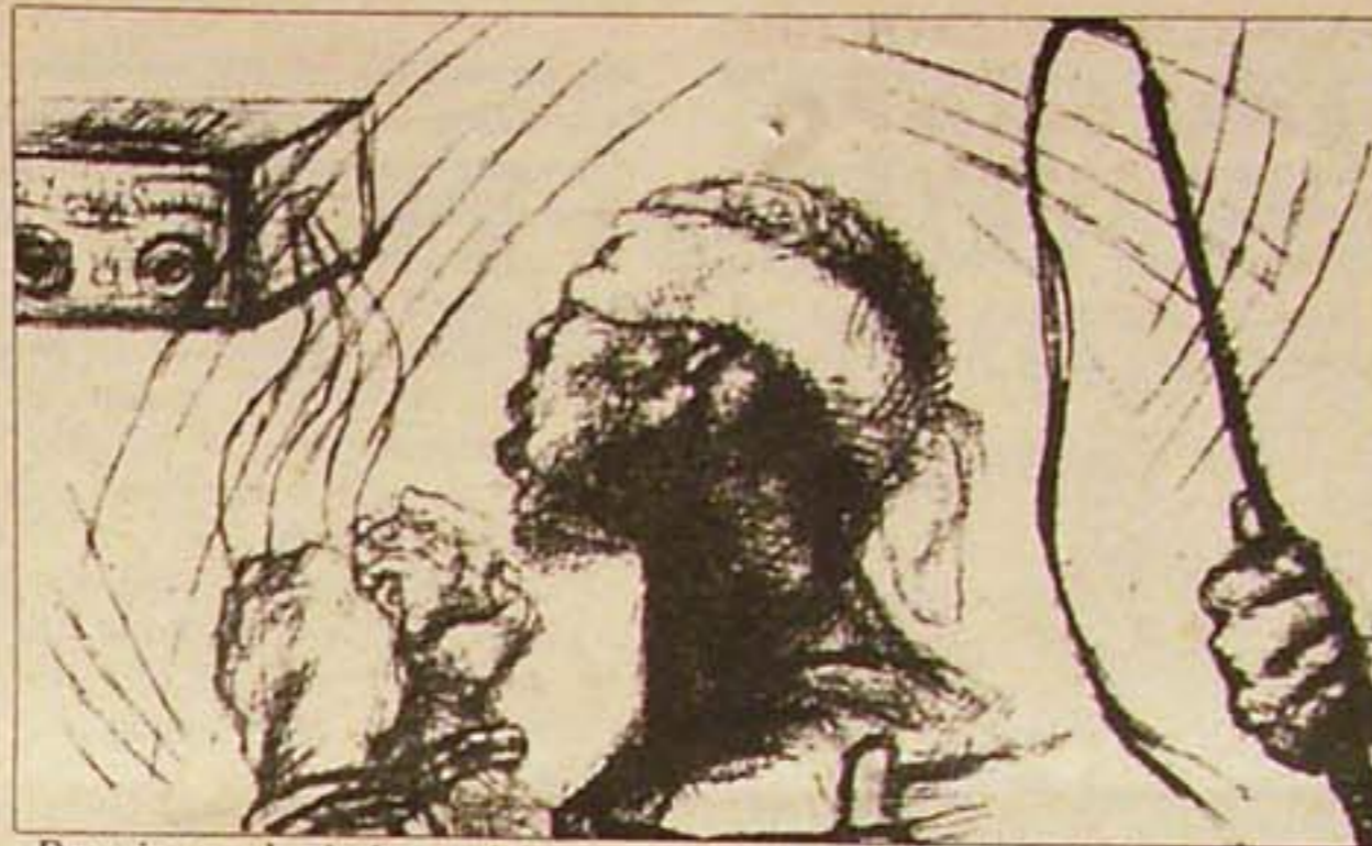
Drawings depicting vicious treatment of political prisoners in Namibian prisons.

Following the breakdown of last year's Geneva talks on Rhodesia, the presidents of the frontline states in southern Africa