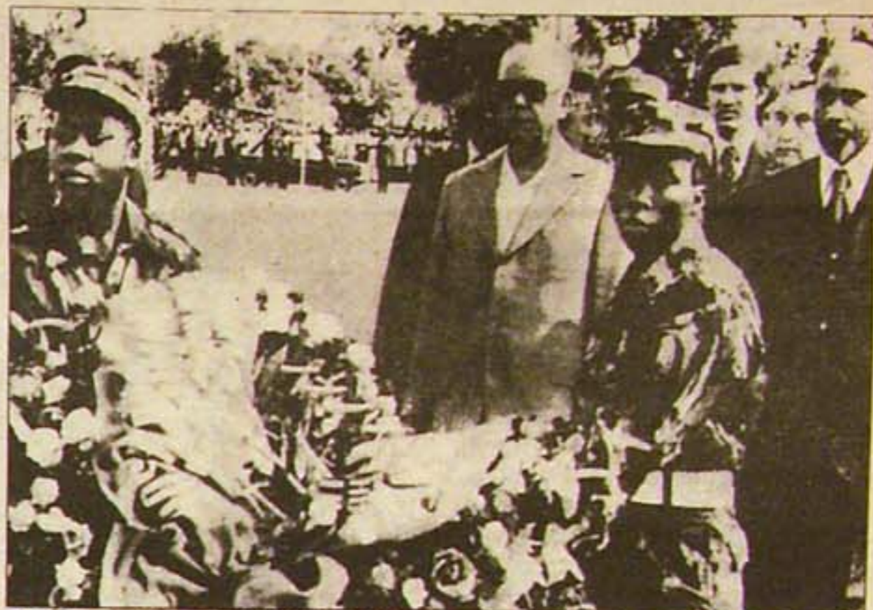
Soviet President PODGORNY (center), next to Mozambique Prime Minister, JOAQUIM CHISSANO at ceremony for FRELIMO fallen guerrillas.

Prior to his departure last week from the People's Republic of Angola, Premier Castro told a huge rally in Luanda that Cuba "will never negotiate with Yankee imperialists" over Cuban