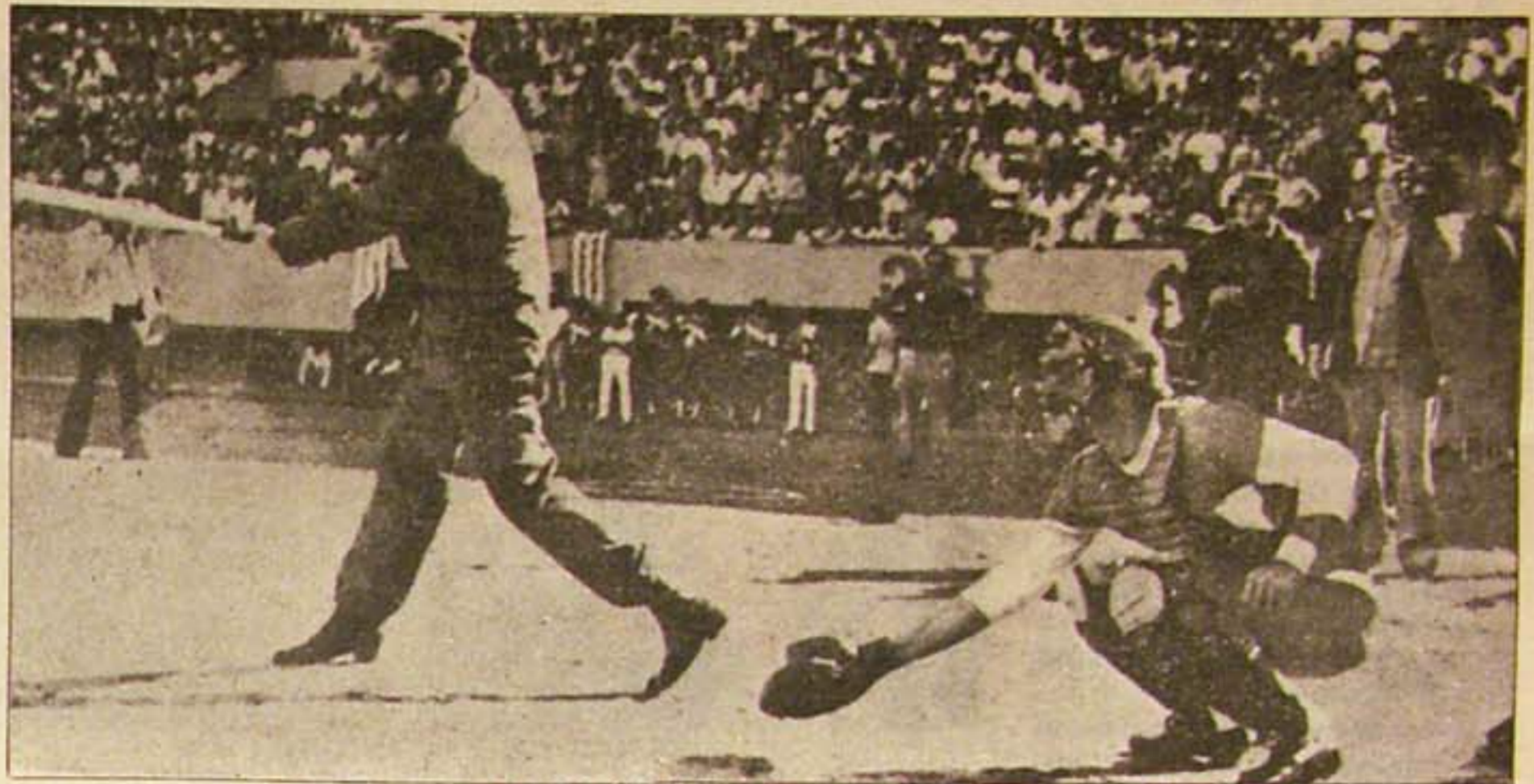
Cuban Premier FIDEL CASTRO takes hefty swing in Havana ballgame.

Each time that we call forth the stress response in practice, it becomes an instinctive process to superimpose controlled breathing along with the stress. What this accomplishes is that first it relaxes the mental and physical state by controlling nervous responses to outside stimuli. Second, by controlling breath patterns, nervous and muscular impulses can be directed toward a rational response to stresses.